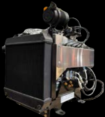
PSI 1.0L EFI, 4 CYL