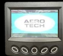
LED Digital Display