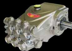
General Pump PEHT2010S Pump