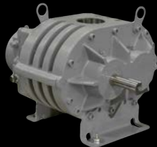
MD Pneumatics 5006 Blower